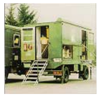
Shelter Kitchen EKÜ II The new generation of permanently mounted shelter kitchens from Kärcher for the German frontier guard.