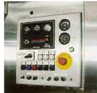
User friendly central control panel

(CrNi 18/10). This permits quick cleaning and disinfection for immediate operational readiness and optimal hygiene.