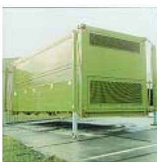
Containerized Kitchen CEK Future technology: containerized kitchens exclusive from Kärcher.