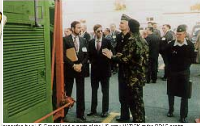
Inspection by a US-General and experts of the US army NATICK at the RD&E centre