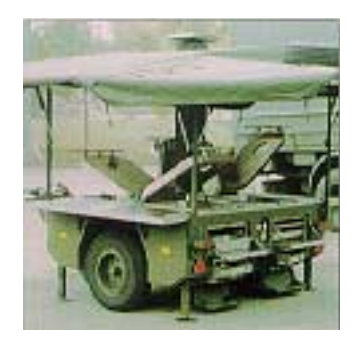
Tactical Field Kitchen TFK Proven throughout the world in armed forces operations.