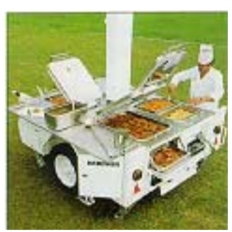
Modular Field Kitchen MFK Flexible kitchen for civil defense and disaster control organisations as well as for UN operations.